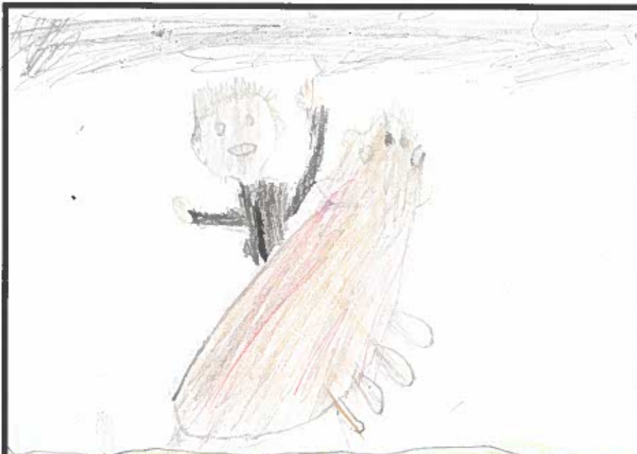
The Savage riding Princess Patricia like a maniac!